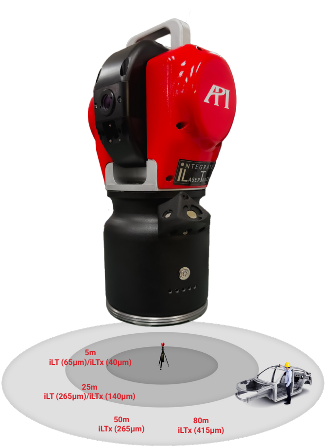
VOLUMETRIC ACCURACY (MPE)

*Measurement of a ScaleBar per ASME B89.4.19-2006 **Specifications are listed in MPE ***Capable of hot-switching with External battery